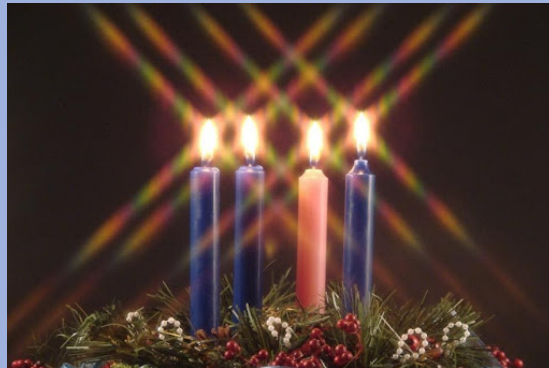
The Fourth Sunday of Advent

www.standrewskentct.org * 860.927.3486 * st.andrew.kent@snet.net